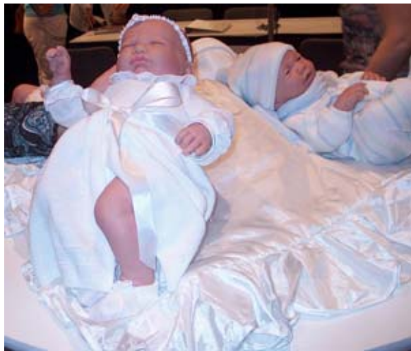
Porcelain dolls handmade by Molly

Berenguer babies – new sculpt, not yet available