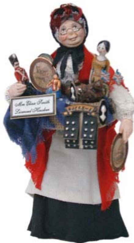
59.00 Pounds Sterling

The Pedlar Doll pictured below is a 1/12 scale dollhouse doll from Twin Firs in the UK. Isn't there an amazing amount of detail for such a small doll? Note her red shawl, bonnet, and vendor's license! These are features you can incorporate in your own pedlar costume or doll, if you choose to make a traditional-style doll.